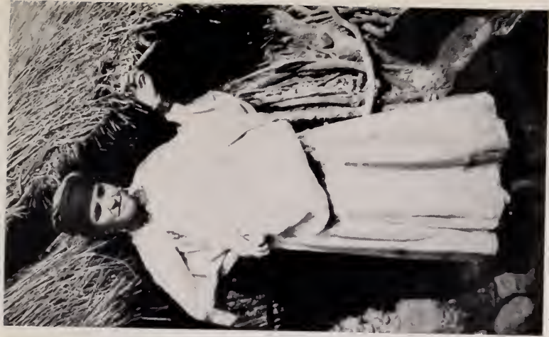
The "new woman" of Kabylia at the door of her mud hut